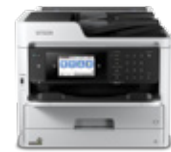
WorkForce Pro WF-C5790 Print/Scan/Copy/Fax