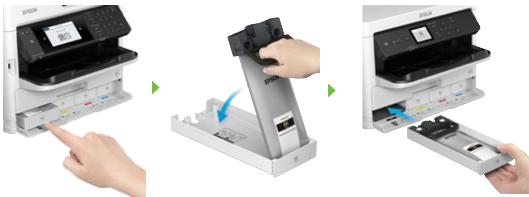
Designed for easy replacement of ink packs