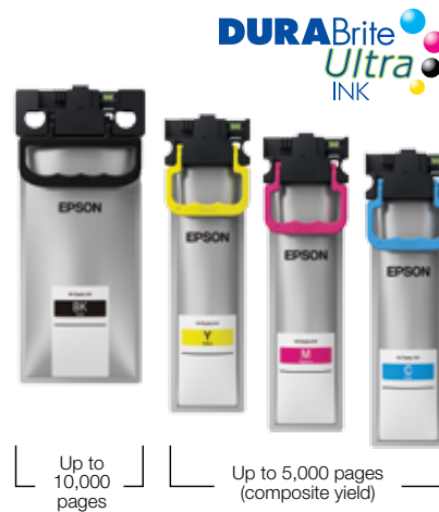
Enjoy greater cost-savings with these high-volume ink packs

In addition, Epson's DURABrite™ Ultra ink delivers laser-like quality prints that are water and smudge-resistant.