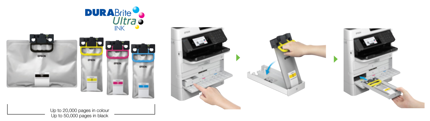
Enjoy greater cost-savings with these high-volume ink packs

In addition, Epson's DURABrite™ Ultra ink delivers laser-like quality prints that are water, fade and smudge-resistant.